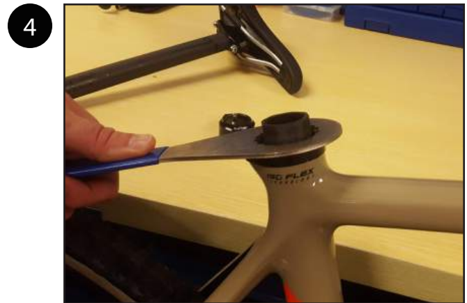
Using one of the recommended tools, loosen and remove the lock ring.