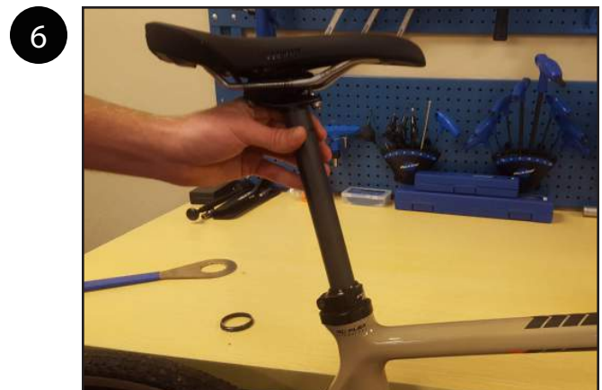
Slide the seat post into the ISO FLEX insert. The saddle height is not critical.