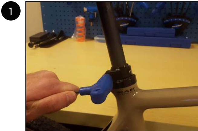
Using an M4 allen wrench, loosen the seat post clamp bolt.