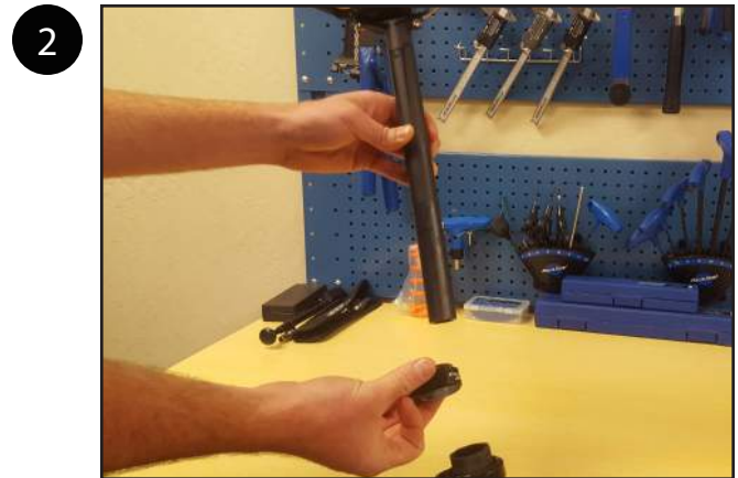
Remove the seat post and seat post clamp.