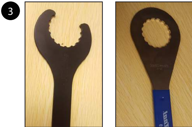
The tool used to loosen the lock ring is a Park Tool BBT-9 or a Shimano Tool TL-FC32.