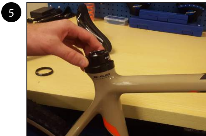
Place the seat post clamp back on the ISO FLEX insert with the lock ring now removed.